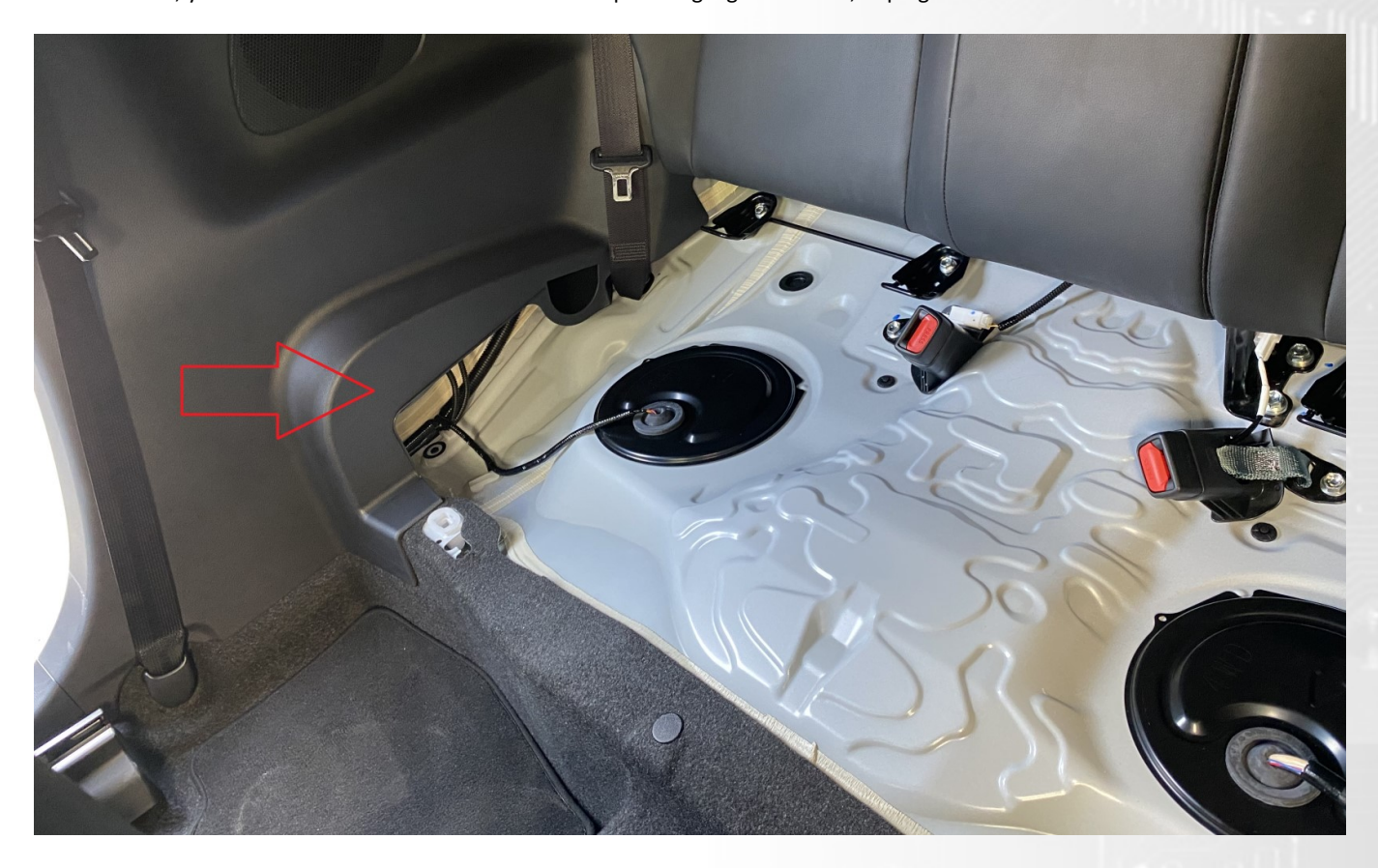
Unplug and remove OEM Controller, bolt the Syvecs Yaris AWD Unit in its place

Once removed, you will find the OEM AWD Ecu behind the panel highlighted below, unplug it and remove